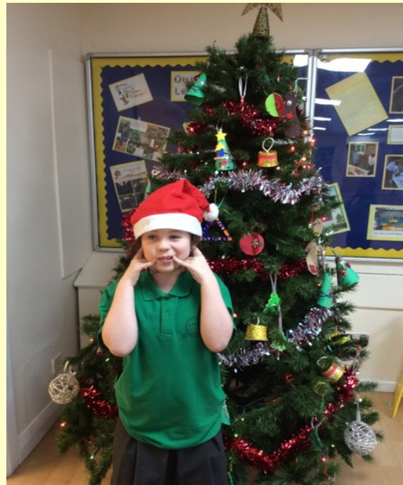
Class 12 have enjoyed doing lots of Christmas activities. We loved the Christmas display in Taskers and decorating the tree in school.