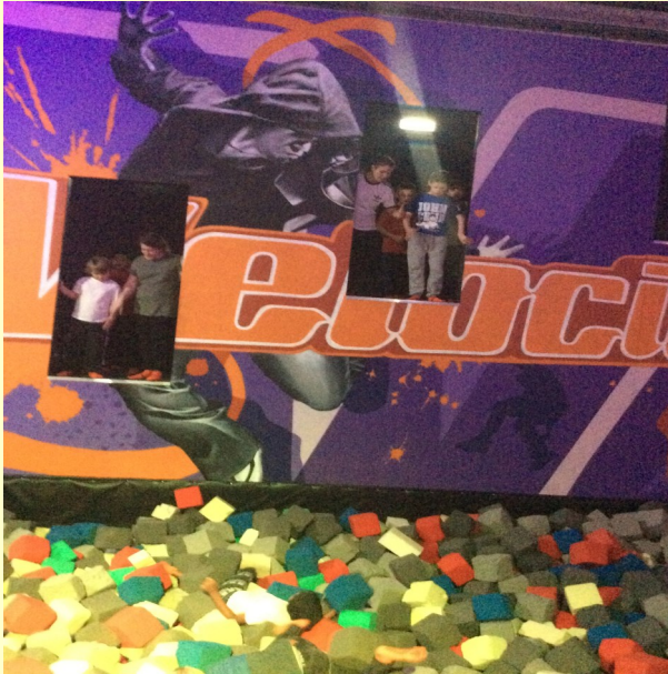
Classes 14 and 15 enjoyed their day out to Velocity Trampolining!