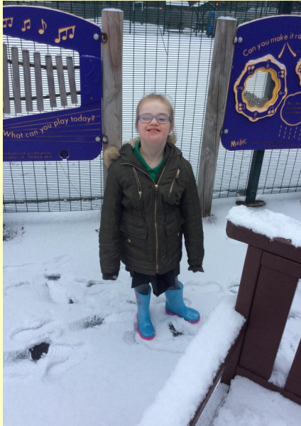
Class 4 had no problem with the 'Beast from the East' and loved playing out in the snow!