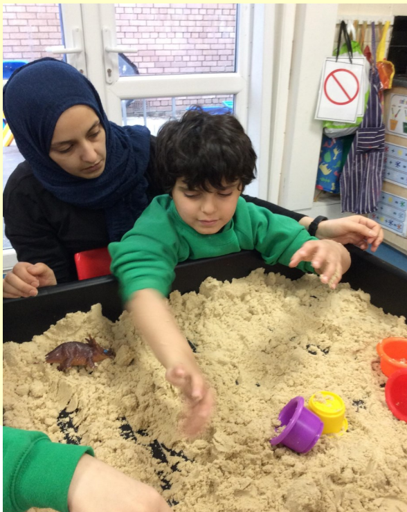
Class 9 have been doing lots of sensory activities this term!