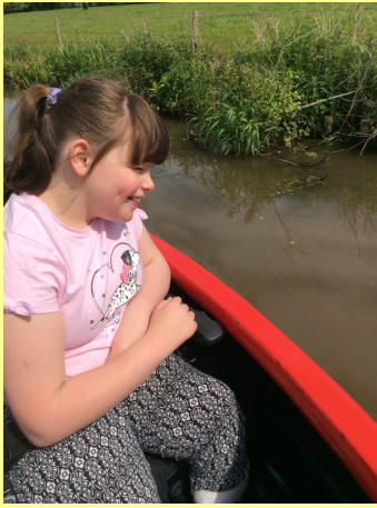
Class 8 loved our canal trip and the royal wedding street party!