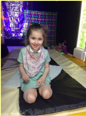
We have been doing lots of lovely sensory activities as well!