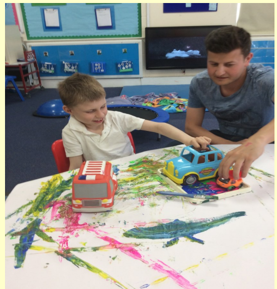
Class 9 have been doing lots of activities around our topic of transport!