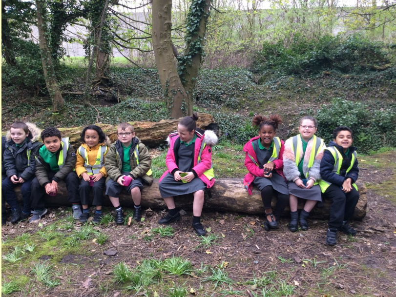
Class 10 went on a dragon hunt!