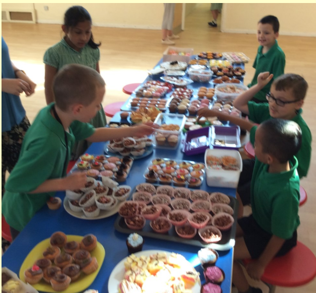
We had a cake sale and pyjama day to raise money for school! Here are some of Classes 4 and 10 buying their cakes and in their pyjamas!